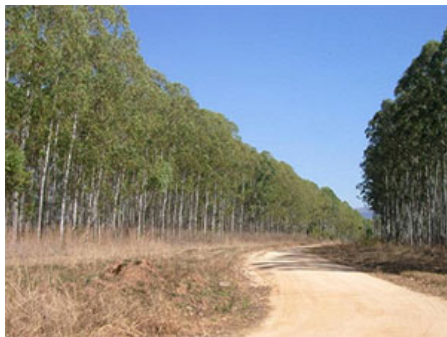
[A eucalyptus plantation in Mpumalanga Province, South Africa]

Sojitz Corporation established Sojitz Maputo Cellulose, Limitada (SOMACEL) as a wholly-owned subsidiary of the Sojitz Group in Mozambique to operate the project. SOMACEL will procure raw timber from Mpumalanga Province in South Africa and the Eucalyptus and Acacia plantations in Kingdom of Swaziland, export the timber from Mozambique, and process it to manufacture wood chips. SOMACEL plans to start operations at the chip processing plant this fiscal year. The plant will supply 200,000 BDT (bone dry tons) of wood chips to Japan each year.